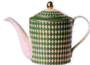
'Chess' teapot by Pols Potten, £90, Flannels (flannels.com)