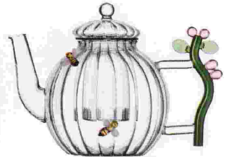
'Botanica' teapot by Alessandra Baldereschi for Ichendorf Milano, £61, SCP (scp.co.uk)