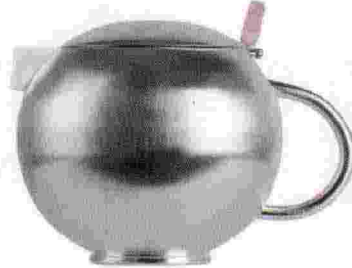
'Teiera' teapot, approx £640, Natalia Criado (nataliacriado.com)