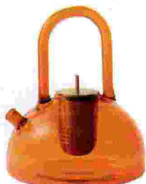
'The Hot' teapot by Neri & Hu for Paola C, £360, Monologue (monologuelondon.com)