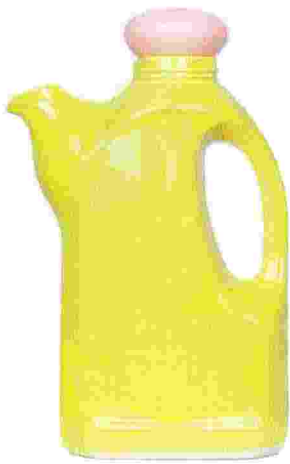
'Laundry' teapot, approx £180, Lola Mayeras (lalamayeras.com)