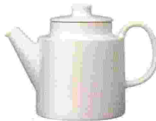
'Teema' teapot by Kaj Franck, £60, Iittala (iittala.com)