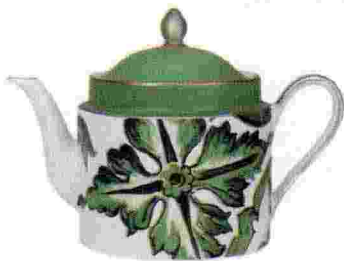
'Verde Maiolica' teapot, £750, Dolce & Gabbana Casa (dolcegabbana.com)